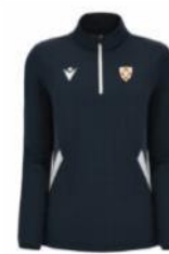
KES VI Lichfield PE 1/4 Zip Midlayer Female