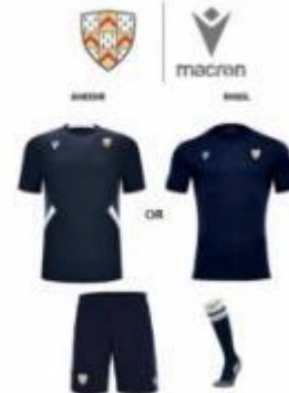
COMPULSORY PE BUNDLE MALE