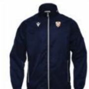
KES VI Lichfield PE Rain Jacket Unisex