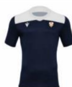
KES VI Lichfield PE Rugby Jersey