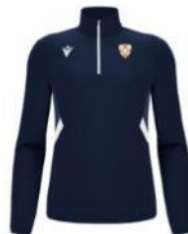
KES VI Lichfield PE 1/4 Zip Midlayer Male