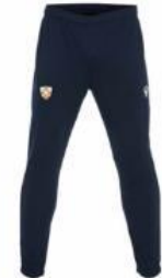
KES VI Lichfield PE Trackpant Unisex