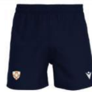
KES VI Lichfield PE Rugby Short