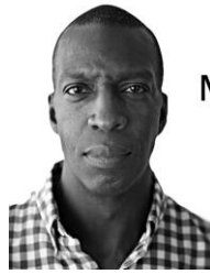
Michael Johnson: Survival Of The Fastest